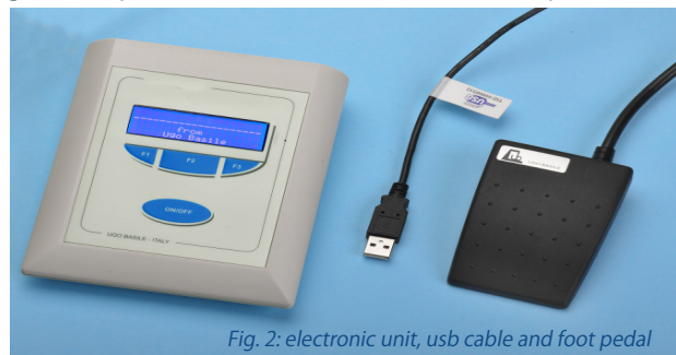
Fig. 2: electronic unit, usb cable and foot pedal

The e-VF comes as a complete package including touch stimulator transducer with prism , electronic unit with power supply, foot pedal, software & USB cable . The mesh grid with platform, and animal enclosure are optional.