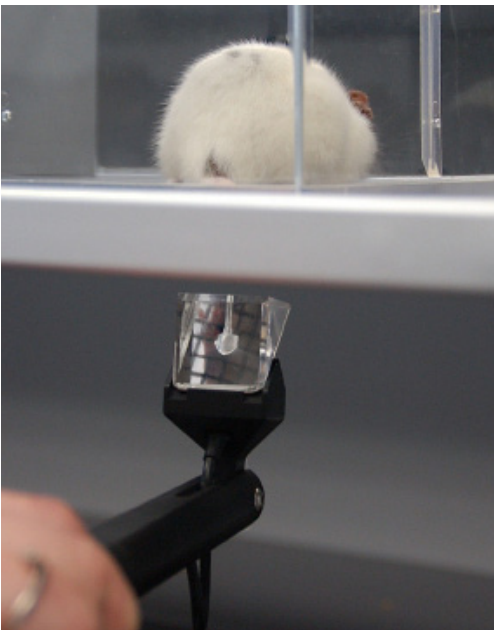
Fig. 1: "touch stimulator" with prism. Optional grid mesh not included

The metal tip used in the e-VF is the same as the one used in the classic Ugo Basile Dynamic Plantar Aesthesiometer 37450 , allowing consistent comparison of results among the two instruments.