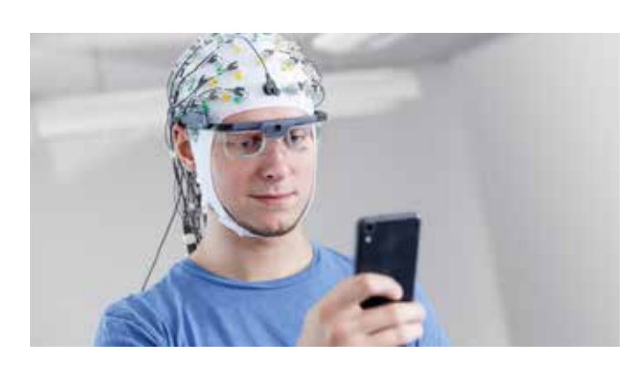
Learn what physiological responses are triggered by visual stimuli by combining Pro Glasses 2 with other biometric data streams