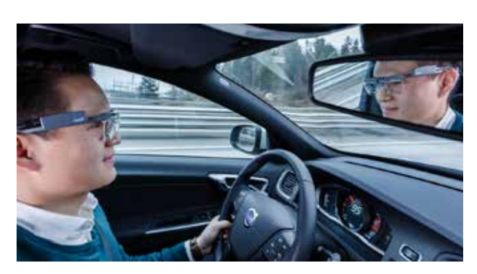
Capture natural human behavior to evaluate interfaces, physical products, or environments, for optimal user experience.

Powerful post-analysis and visualization tools provide a full spectrum of qualitative and quantitative gaze data analysis and visualizations. You can easily log events, define areas of interest, calculate statistics, create heat maps, and export data for further analysis in other software