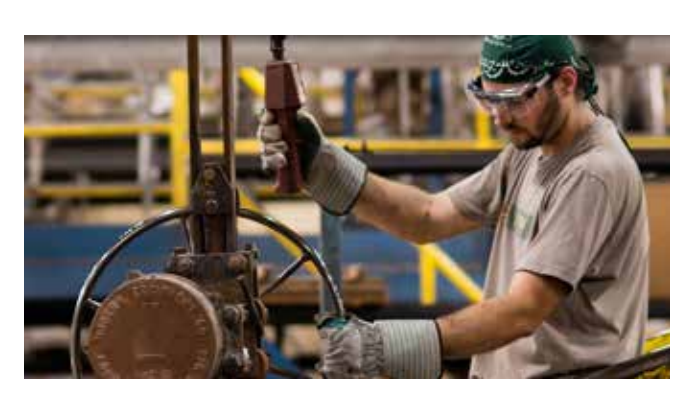
Improve professional training, identify best skills practices, and optimize processes and factors influencing performance in the workplace.