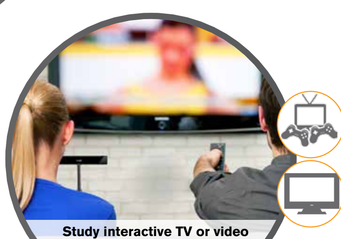
games on a larger screen.