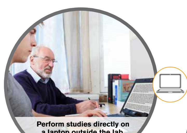
Perform studies directly on a laptop outside the lab.